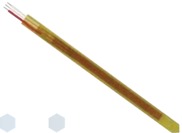
RTD Single Element Paddle